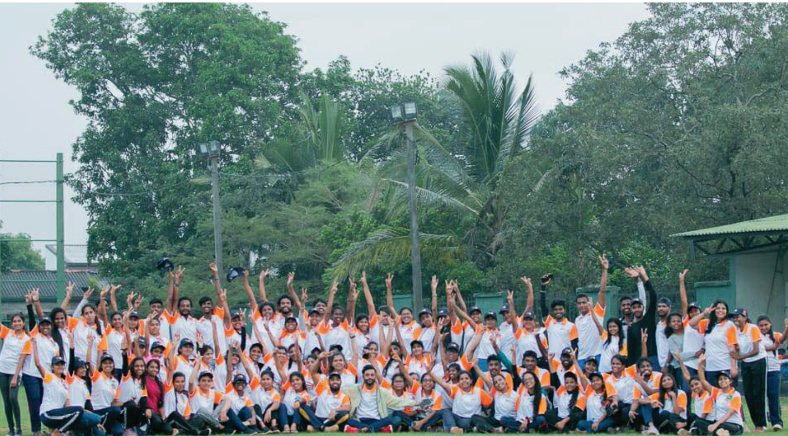
Mass Communication undergraduates of the Faculty of Humanities and Social Sciences - University of Sri Jayewardenepura