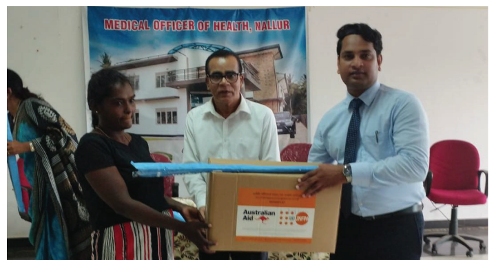
FPA facilitated the distribution of Maternity and Dignity kits in Jaffna later in the day.