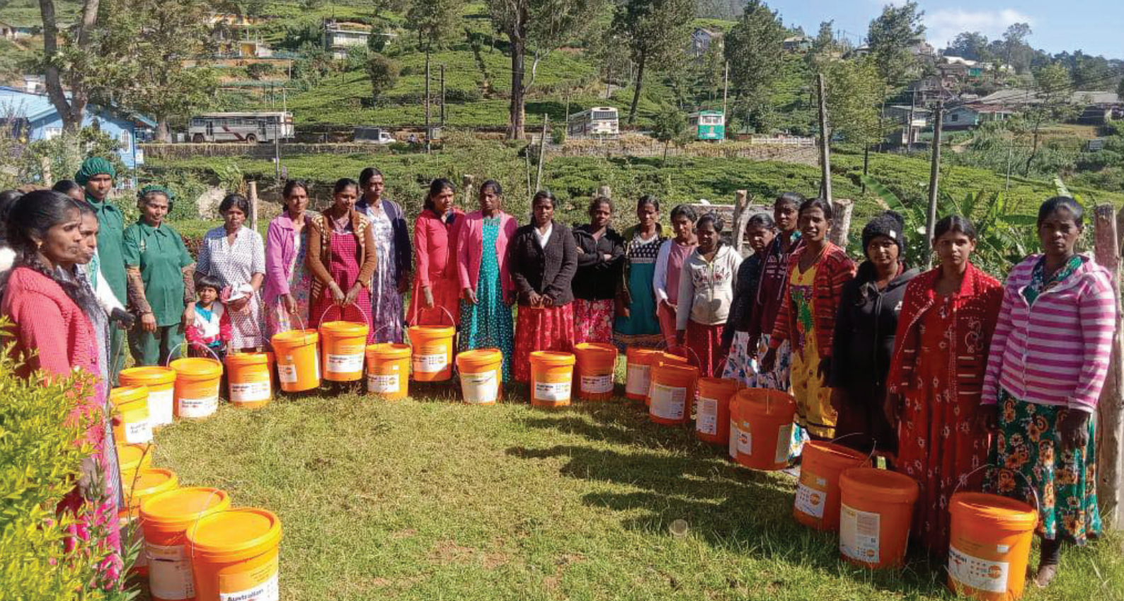
Dignity Kits distribution at Pedro Estate – Nuwara Eliya.