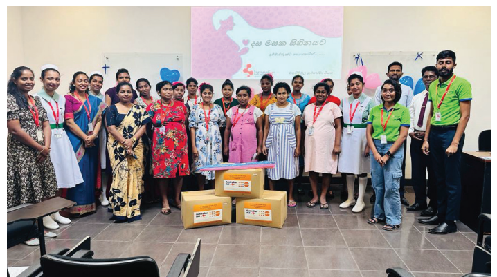
At the Koggala Export Processing Zone

We believe in ensuring the basic hygiene needs of all women and girls.