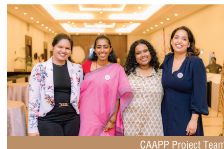
CAAPP Project Team