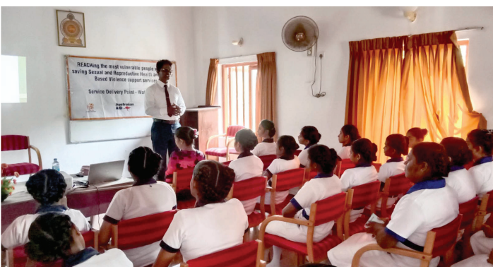
Workshop at Sujatha Nursing School

Collectively, nurses can use their unique combination of knowledge and skills to make a positive impact on sexual and reproductive outcomes. Nurses have the capacity and opportunity to disseminate information about sexual and reproductive health to those in communities, schools, public health clinics, and other care settings.