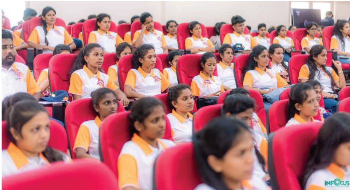
At Rajarata University

Youth camp highlights: Click to view. Testimonials: Click to view.