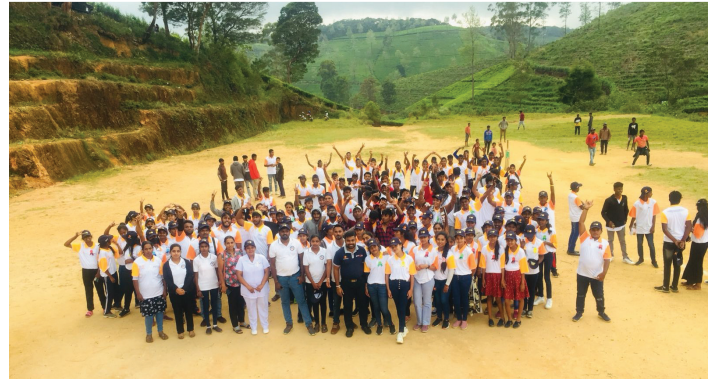
In Nuwara Eliya.