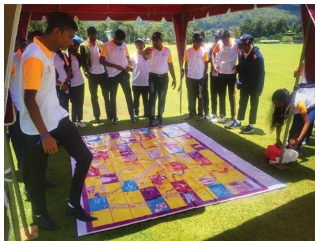
At the Nuwara Eliya municipal grounds