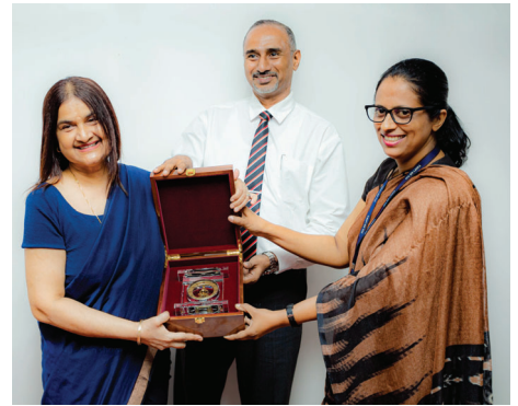
Token of Appreciation from staff