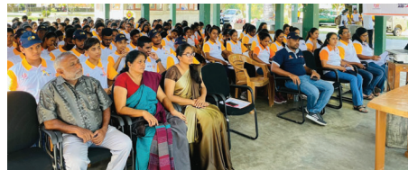
At the Urban Council Park in Ampara.