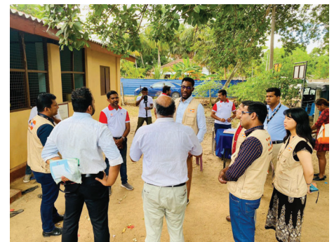
Kunle Adeniyi, the UNFPA country representative and team visited mobile clinics conducted by the Batticaloa and Nuwara Eliya Service Delivery Points.

A mobile clinic is an alternative and fast way to bring health services to people in remote areas. FPA considers health and well-being an important need that must be fulfilled to achieve the dignity of life. Everyone is entitled to visit the clinic, avoiding transportation costs and mobility complications.