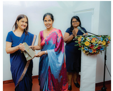
12 Years of Excellence - Gold Coin Token