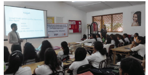
Our Wathupitiwala Service Delivery Point conducted an SRH awareness programme for adolescent girls attached to the Mirigama Youth Centre. Such SRH awareness sessions aim to equip young people with knowledge, skills, attitudes and values needed for a healthy life