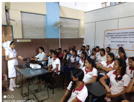
Our Koggala Service Delivery Point conducted an awareness session on SRH and Menstrual Hygiene, for students attached to the National Vocational Training Institute.