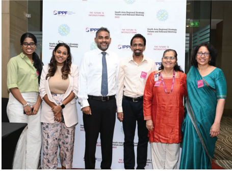
The FPA delegation from left to right:

IPPF's Regional Meeting for the rollout of the new Strategy "Come Together" took place in Delhi from the 22 nd -25 th of August 2023. Representatives of all Member Associations met in Delhi to discuss and deliberate so the Federation is aligned in its approach to advancing SRHR in South Asia.