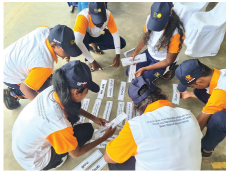
Youth camp held in Meegoda for the National Youth Services Council - Colombo District Youth Clubs Federation.

This innovative and interactive approach aims to create an environment where youth can freely engage in conversations surrounding sexual and reproductive health and seek essential SRH services when needed.